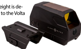
AR Riser/Cowitness Mount