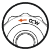
Adjustment direction CCW